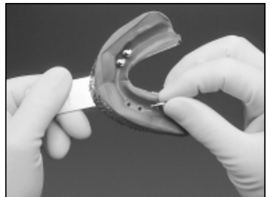
Figure 34. Place the O-Ring analogs into the impression opening.