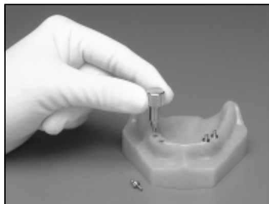
Figure 32. Screw O-Rings onto implant body with O-Ring seating tool.

O-Ring Attachments are used for retaining overdentures and partial dentures when resilience and facilitated oral hygiene is desired. The O-Ring abutment is fabricated from titanium alloy and available in variable cuff heights that incorporates a coronal spherical geometry which snaps into a rubber O-Ring in the denture or partial denture acrylic base. The O-Ring abutments are threaded into the implant using the O-Ring abutment seating tool. The O-Rings are not intended for use if there is more than 10 degrees convergence or divergence between implants. The spacing between implants (center to center) must be greater than 6.5mm.