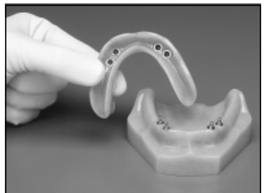
Figure 35. O-Ring retainers are incorporated into the denture.